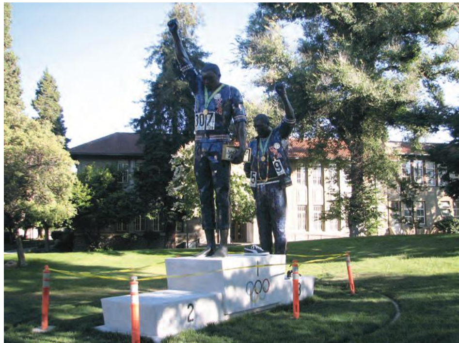
In 2005, the San Jose State University installed a 20-foot high sculpture representing the protest by Tommie Smith and John Carlos. A photograph of the original medal ceremony in 1968 is on the top.

Do you think that Carlos and Smith should have raised an internal matter of American society in an international forum? Would you say that what they did was political? Why do you think Peter Norman, who was neither Black nor American, joined in the gesture of protest? If you were in Norman's place what would you do?