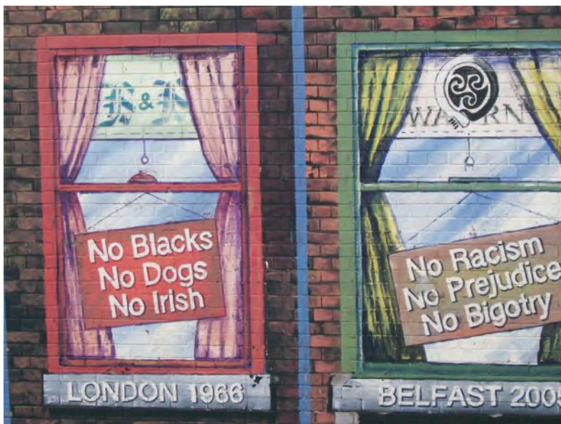
In some societies of Northern Ireland, the colonies of Protestant and Catholic communities are divided by walls. These walls are sometimes filled with graffiti as you can see here. The Irish Republican Army and British Government signed an agreement in 2005. What does the graffiti here tell about the conflict in the society?

Second, it depends on how political leaders raise the demands of any community. It is easier to accommodate demands that are within the constitutional framework and are not at the cost of another community.