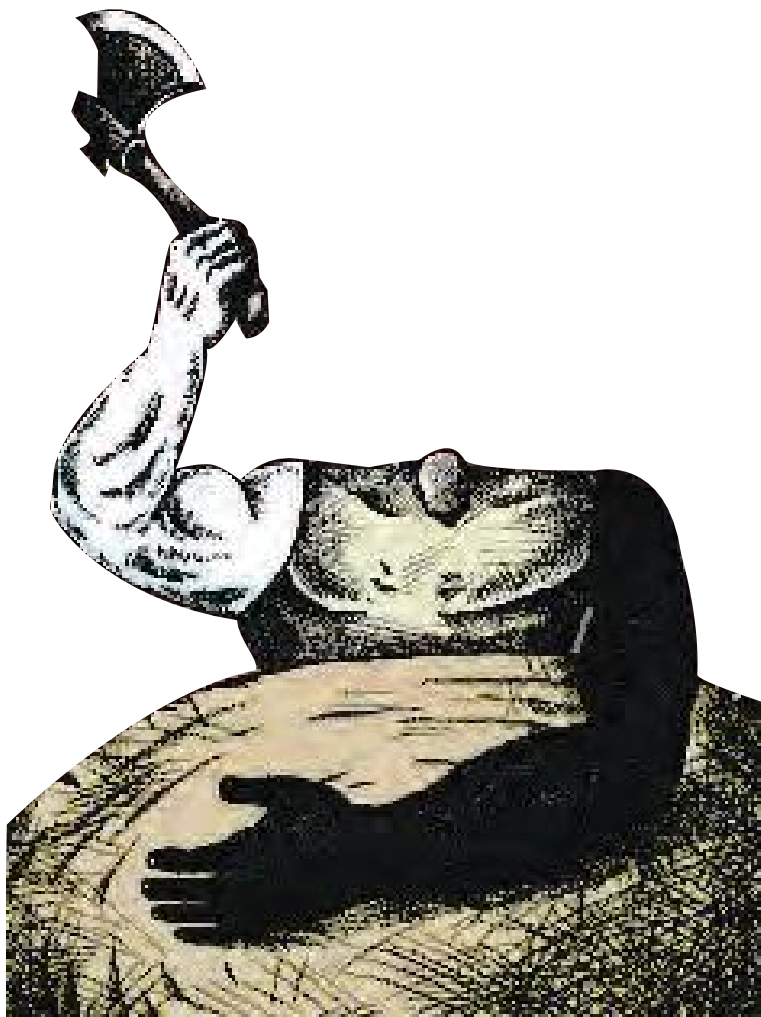
© Ares - Cagle Cartoons Inc.

It is fairly common for people belonging to the same religion to feel that they do not belong to the same community, because their caste or sect is very different. It is also possible for people from different religions to have the same caste and feel close to each other. Rich and poor persons from the same family often do not keep close relations with each other for they feel they are very different. Thus, we all have more than one identity and can belong to more than one social group. We have different identities in different contexts.