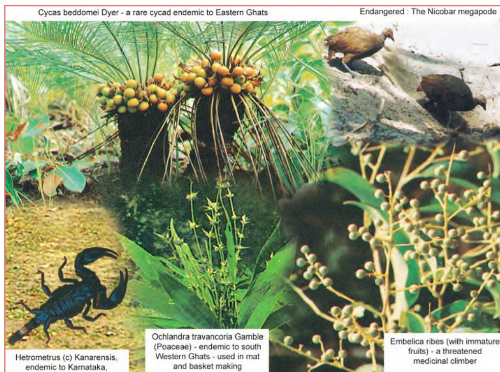
Fig. 2.2: A few extinct, rare and endangered species

a resource obtaining directly and indirectly from the forests and wildlife – wood, barks, leaves, rubber, medicines, dyes, food, fuel, fodder, manure, etc. So it is we ourselves who have depleted our forests and wildlife. The greatest damage inflicted on Indian forests was during the colonial period due to the expansion of the railways, agriculture, commercial and scientific forestry and mining activities. Even after Independence, agricultural expansion continues to be one of the major causes of depletion of forest resources. Between 1951 and 1980, according to the Forest Survey of India, over 26,200 sq. km. of forest area was converted into agricultural land all over India. Substantial parts of the tribal belts, especially in the north-eastern and central India, have been deforested or degraded by shifting cultivation (jhum), a type of 'slash and burn' agriculture.