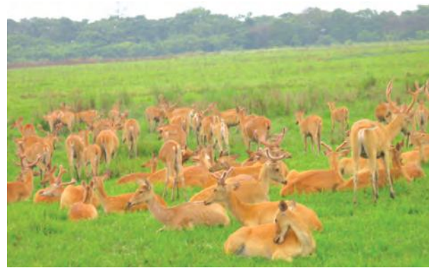
Fig. 2.4: Rhino and deer in Kaziranga National Park

dwindled to 1,827 from an estimated 55,000 at the turn of the century. The major threats to tiger population are numerous, such as poaching for trade, shrinking habitat, depletion of prey base species, growing human population, etc. The trade of tiger skins and the use of their bones in traditional medicines, especially in the Asian countries left the tiger population on the verge of extinction. Since India and Nepal provide habitat to about two-thirds of the surviving tiger population in the world, these two nations became prime targets for poaching and illegal trading.