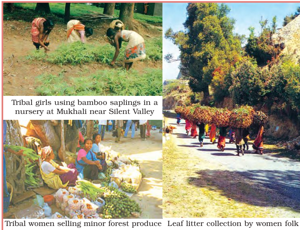
Tribal girls using bamboo saplings in a nursery at Mukhali near Silent Valley

Habitat destruction, hunting, poaching, over-exploitation, environmental pollution, poisoning and forest fires are factors, which have led to the decline in India's biodiversity. Other important causes of environmental destruction are unequal access, inequitable consumption of resources and differential sharing of responsibility for environmental well-being. Over-population in third world countries is often cited as the cause of environmental degradation. However, an average American consumes 40 times more resources than an average Somalian. Similarly, the richest five per cent of Indian society probably cause more ecological damage because of the amount they consume than