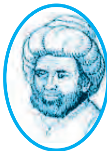
Muhammad ibn Musa al-Khwarizmi (C.E. 780 – 850)

A lemma is a proven statement used for proving another statement.