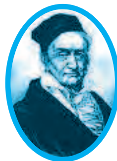
Carl Friedrich Gauss (1777 – 1855)

Carl Friedrich Gauss is often referred to as the 'Prince of Mathematicians' and is considered one of the three greatest mathematicians of all time, along with Archimedes and Newton. He has made fundamental contributions to both mathematics and science.