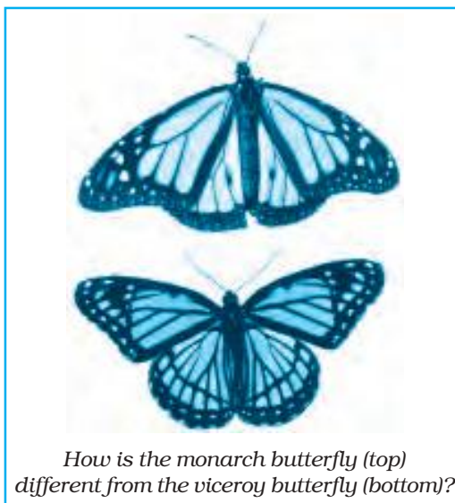
How is the monarch butterfly (top) different from the viceroy butterfly (bottom)?