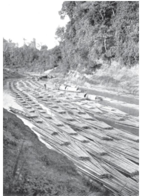
Fig.4 – Bamboo rafts being floated down the Kassalong river, Chittagong Hill Tracts.

From the 1860s, the railway network expanded rapidly. By 1890, about 25,500 km of track had been laid. In 1946, the length of the tracks had increased to over 765,000 km. As the railway tracks spread through India, a larger and larger number of trees were felled. As early as the 1850s, in the Madras Presidency alone, 35,000 trees were being cut annually for sleepers. The government gave out contracts to individuals to supply the required quantities. These contractors began cutting trees indiscriminately. Forests around the railway tracks fast started disappearing.