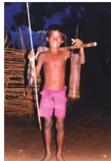
Fig. 17 – The little fisherman. Children accompany their parents to the forest and learn early how to fish, collect forest produce and cultivate. The bamboo trap which the boy is holding in his right hand is kept at the mouth of a stream – the fish flow into it.

While the forest laws deprived people of their customary rights to hunt, hunting of big game became a sport. In India, hunting of tigers and other animals had been part of the culture of the court and nobility for centuries. Many Mughal paintings show princes and emperors enjoying a hunt. But under colonial rule the scale of hunting increased to such an extent that various species became almost extinct. The British saw large animals as signs of a wild, primitive and savage society. They believed that by killing dangerous animals the British