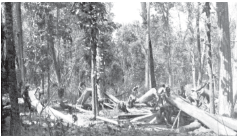
Fig.3 – Converting sal logs into sleepers in the Singhbhum forests, Chhotanagpur, May 1897. Adivasis were hired by the forest department to cut trees, and make smooth planks which would serve as sleepers for the railways. At the same time, they were not allowed to cut these trees to build their own houses.