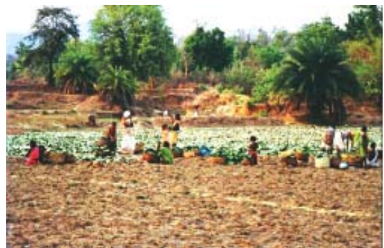
Fig. 13 – Drying tendu leaves. The sale of tendu leaves is a major source of income for many people living in forests. Each bundle contains approximately 50 leaves, and if a person works very hard they can perhaps collect as many as 100 bundles in a day. Women, children and old men are the main collectors.

The Forest Act meant severe hardship for villagers across the country. After the Act, all their everyday practices – cutting wood for their