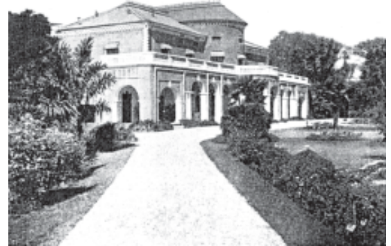
Fig. 11 – The Imperial Forest School, Dehra Dun, India. The first forestry school to be inaugurated in the British Empire.

Foresters and villagers had very different ideas of what a good forest should look like. Villagers wanted forests with a mixture of species to satisfy different needs – fuel, fodder, leaves. The forest department on the other hand wanted trees which were suitable for building