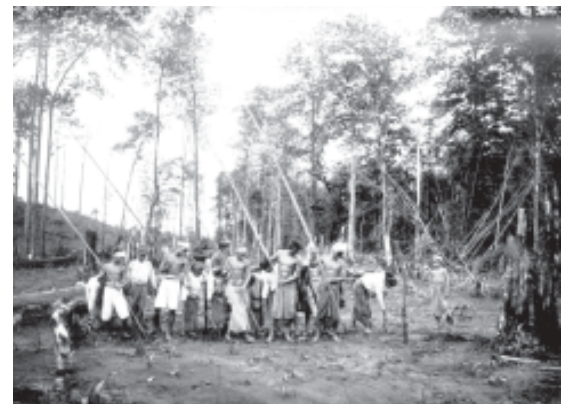
Fig. 15 – Taungya cultivation was a system in which local farmers were allowed to cultivate temporarily within a plantation. In this photo taken in Tharrawaddy division in Burma in 1921 the cultivators are sowing paddy. The men make holes in the soil using long bamboo poles with iron tips. The women sow paddy in each hole.

Children living around forest areas can often identify hundreds of species of trees and plants. How many species of trees can you name?