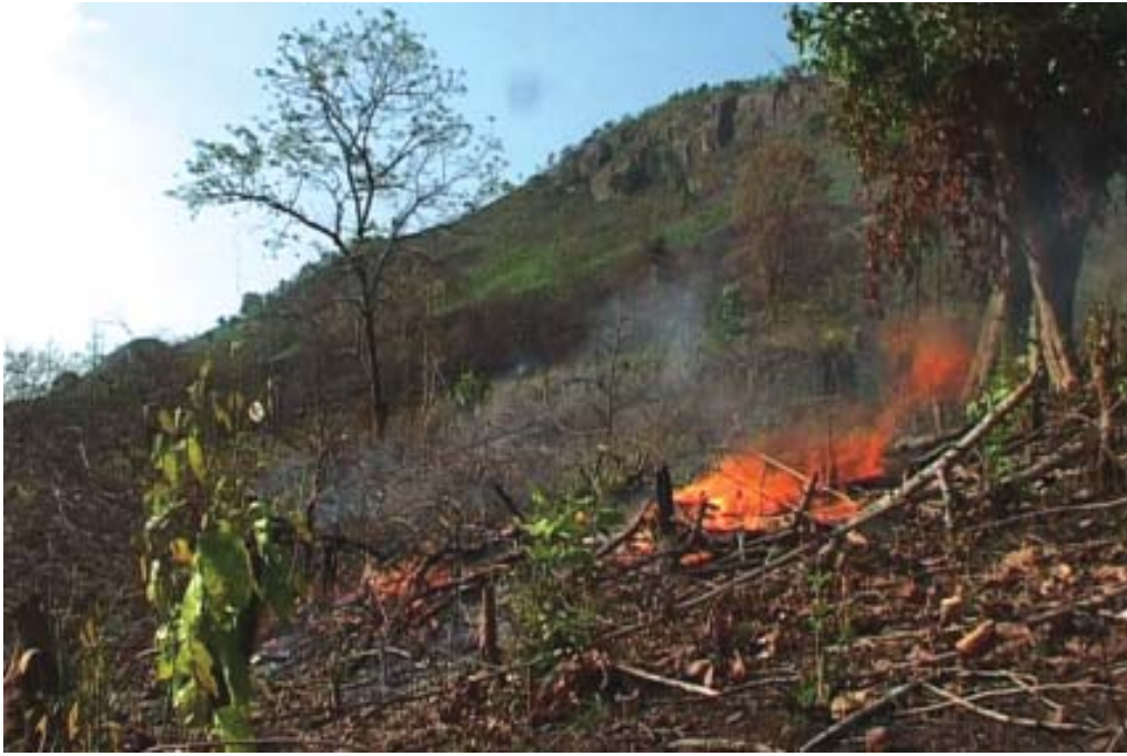
Fig. 16 – Burning the forest penda or podu plot. In shifting cultivation, a clearing is made in the forest, usually on the slopes of hills. After the trees have been cut, they are burnt to provide ashes. The seeds are then scattered in the area, and left to be irrigated by the rain.

Shifting cultivation also made it harder for the government to calculate taxes. Therefore, the government decided to ban shifting cultivation. As a result, many communities were forcibly displaced from their homes in the forests. Some had to change occupations, while some resisted through large and small rebellions.