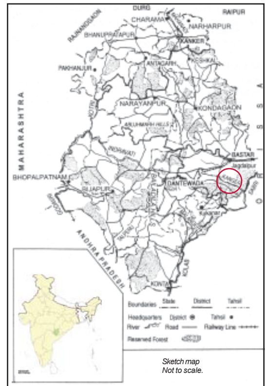
Fig.20 – Bastar in 2000.

Bastar is located in the southernmost part of Chhattisgarh and borders Andhra Pradesh, Orissa and Maharashtra. The central part of Bastar is on a plateau. To the north of this plateau is the Chhattisgarh plain and to its south is the Godavari plain. The river Indrawati winds across Bastar east to west. A number of different communities live in Bastar such as Maria and Muria Gonds, Dhurwas, Bhatras and Halbas. They speak different languages but share common customs and beliefs. The people of Bastar believe that each village was given its land by the Earth, and in return, they look after