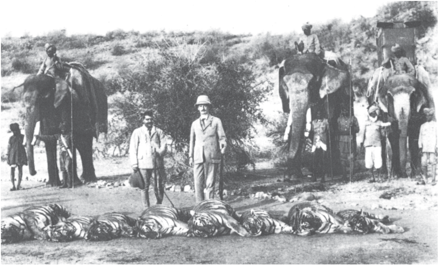
Fig. 18 – Lord Reading hunting in Nepal.

Count the dead tigers in the photo. When British colonial officials and Rajas went hunting they were accompanied by a whole retinue of servants. Usually, the tracking was done by skilled village hunters, and the Sahib simply fired the shot.