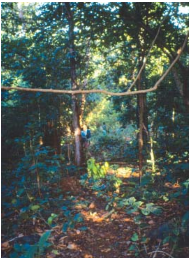
Fig. 1 – A sal forest in Chhattisgarh. Look at the different heights of the trees and plants in this picture, and the variety of species. This is a dense forest, so very little sunlight falls on the forest floor.

A lot of this diversity is fast disappearing. Between 1700 and 1995, the period of industrialisation, 13.9 million sq km of forest or 9.3 per cent of the world's total area was cleared for industrial uses, cultivation, pastures and fuelwood.