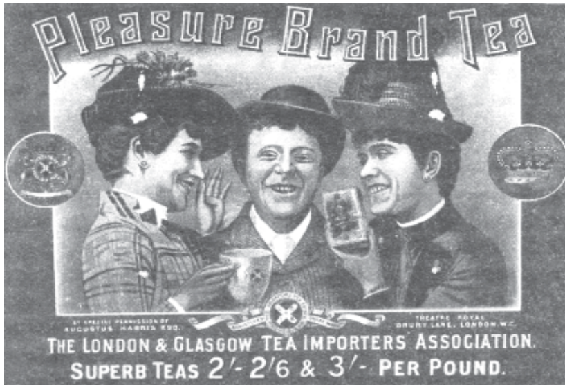
Fig.8 – Pleasure Brand Tea.

Large areas of natural forests were also cleared to make way for tea, coffee and rubber plantations to meet Europe's growing need for these commodities. The colonial government took over the forests, and gave vast areas to European planters at cheap rates. These areas were enclosed and cleared of forests, and planted with tea or coffee.