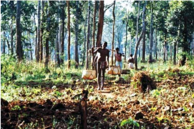
Fig. 14 – Bringing grain from the threshing grounds to the field.

The men are carrying grain in baskets from the threshing fields. Men carry the baskets slung on a pole across their shoulders, while women carry the baskets on their heads.