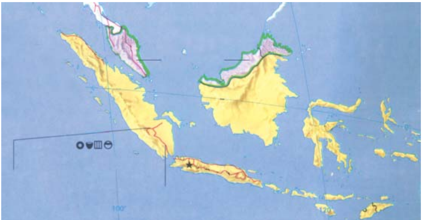
Fig. 22 – Most of Indonesia's forests are located in islands like Sumatra, Kalimantan and West Irian. However, Java is where the Dutch began their 'scientific forestry'. The island, which is now famous for rice production, was once richly covered with teak.

Dirk van Hogendorp, cited in Peluso, Rich Forests, Poor People , 1992.