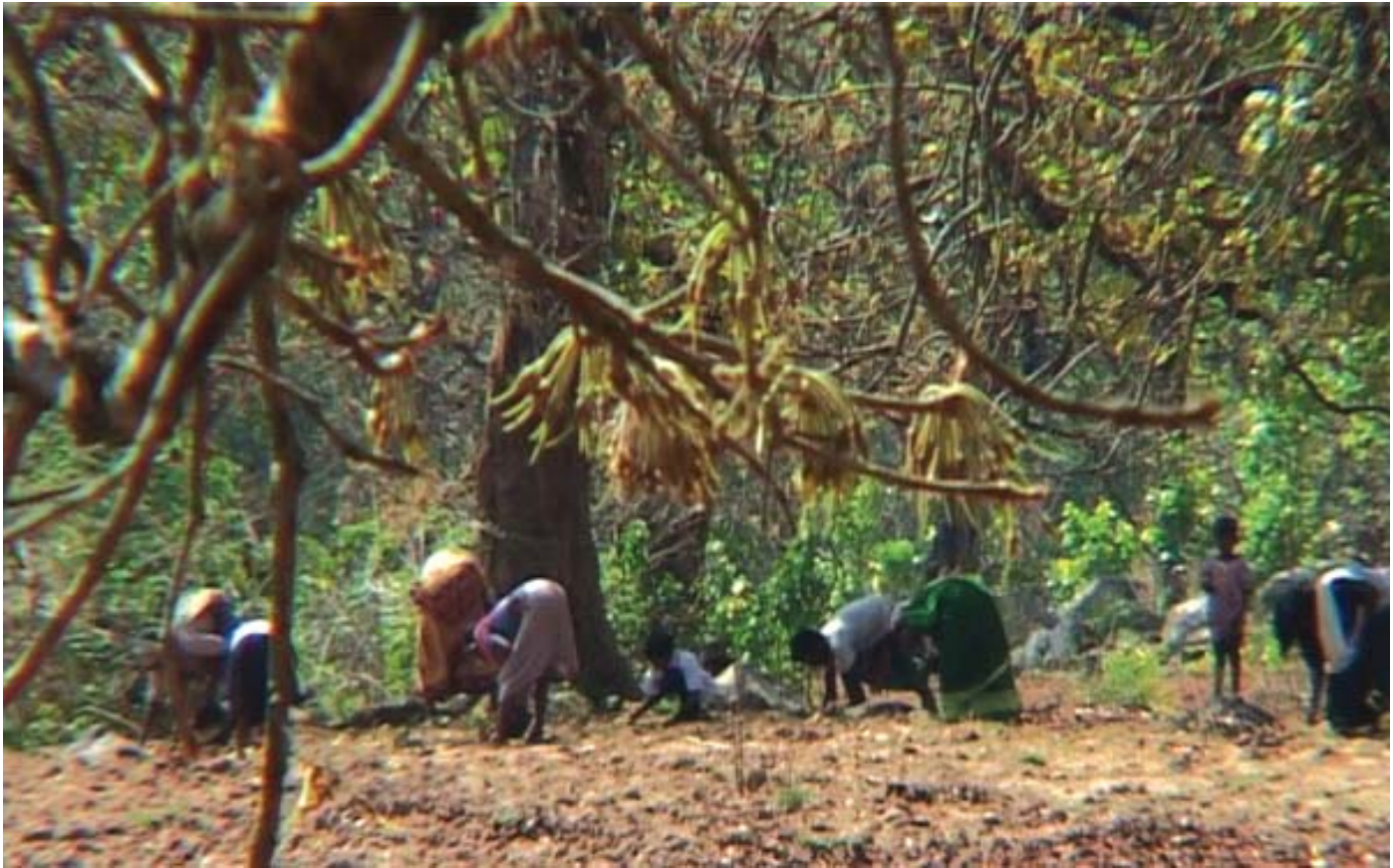
Fig. 12 – Collecting mahua ( Madhuca indica ) from the forests. Villagers wake up before dawn and go to the forest to collect the mahua flowers which have fallen on the forest floor. Mahua trees are precious. Mahua flowers can be eaten or used to make alcohol. The seeds can be used to make oil.

ships or railways. They needed trees that could provide hard wood, and were tall and straight. So particular species like teak and sal were promoted and others were cut.