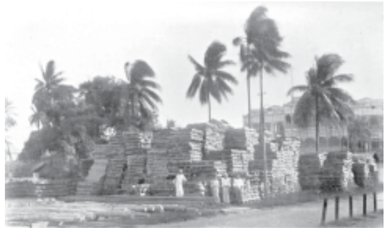
Fig.23 – Indian Munitions Board, War Timber Sleepers piled at Soolay pagoda ready for shipment, 1917.

The Allies would not have been as successful in the First World War and the Second World War if they had not been able to exploit the resources and people of their colonies. Both the world wars had a devastating effect on the forests of India, Indonesia and elsewhere. The forest department cut freely to satisfy war needs.