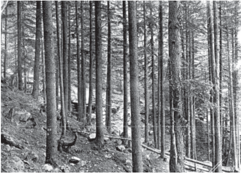
Fig. 10 – A deodar plantation in Kangra, 1933. From Indian Forest Records , Vol. XV.

punished. So Brandis set up the Indian Forest Service in 1864 and helped formulate the Indian Forest Act of 1865. The Imperial Forest Research Institute was set up at Dehradun in 1906. The system they taught here was called ‘ scientific forestry ’. Many people now, including ecologists, feel that this system is not scientific at all.