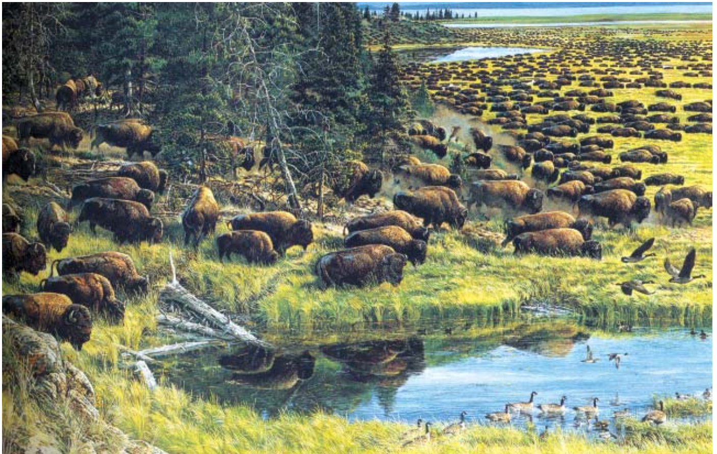
Fig.2 – When the valleys were full. Painting by John Dawson.

In 1600, approximately one-sixth of India's landmass was under cultivation. Now that figure has gone up to about half. As population increased over the centuries and the demand for food went up, peasants extended the boundaries of cultivation, clearing forests and breaking new land. In the colonial period, cultivation expanded rapidly for a variety of reasons. First, the British directly encouraged