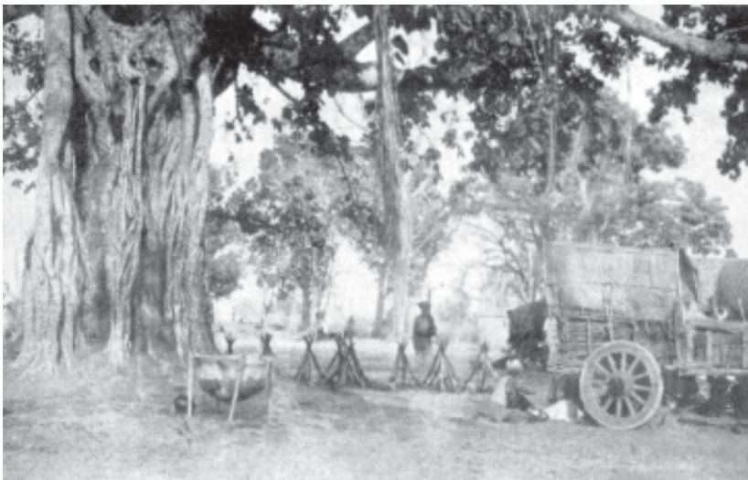
Fig.19 – Army camp in Bastar, 1910.

In 1947 Bastar kingdom was merged with Kanker kingdom and become Bastar district in Madhya Pradesh. In 1998 it was divided again into three districts, Kanker, Bastar and Dantewada. In 2001, these became part of Chhattisgarh. The 1910 rebellion first started in the Kanger forest area (encircled) and soon spread to other parts of the state.